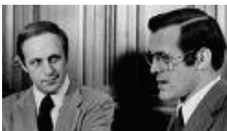
Dick and Don , Donald Rumsfeld as Chief of Staff to Gerald Ford in 1975 with his assistant Dick Cheney.

Facts for Working People says good bye to Donald Rumsfeld with this timeless quote. "Reports that say that something hasn't happened are always interesting to me, because as we know, there are known knowns; there are things we know we know. We also know there are known unknowns; that